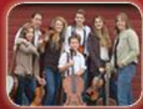
The Rice family